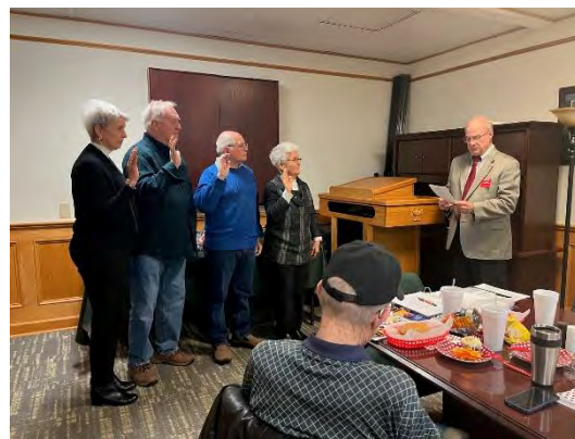
Federation Executive VP swearing in Newberry Chapter officers for 2025-2026.