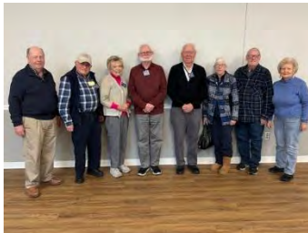
Charleston Chapter 72 members