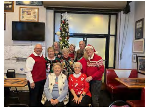
Newberry Chapter members Holiday Party